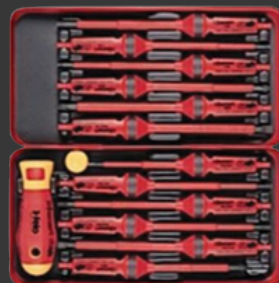
Bondhus® Felo 53439 E-SMart Screwdriver Set, 14 piece